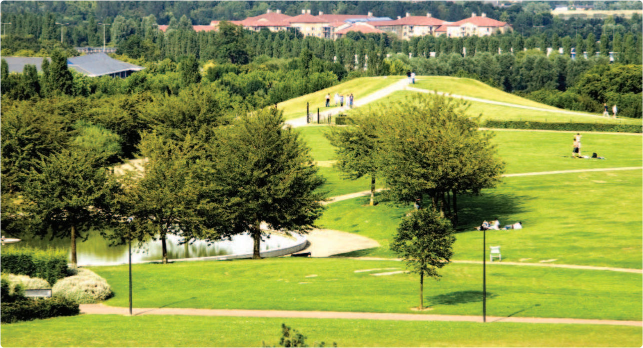
Campbell Park, Milton Keynes – in Milton Keynes the Parks Trust was created to care for most of the city's green space

long-term, low-interest funding, and whether the local authority or developer is willing (or able) to take a long-term approach to making a return on their investment.