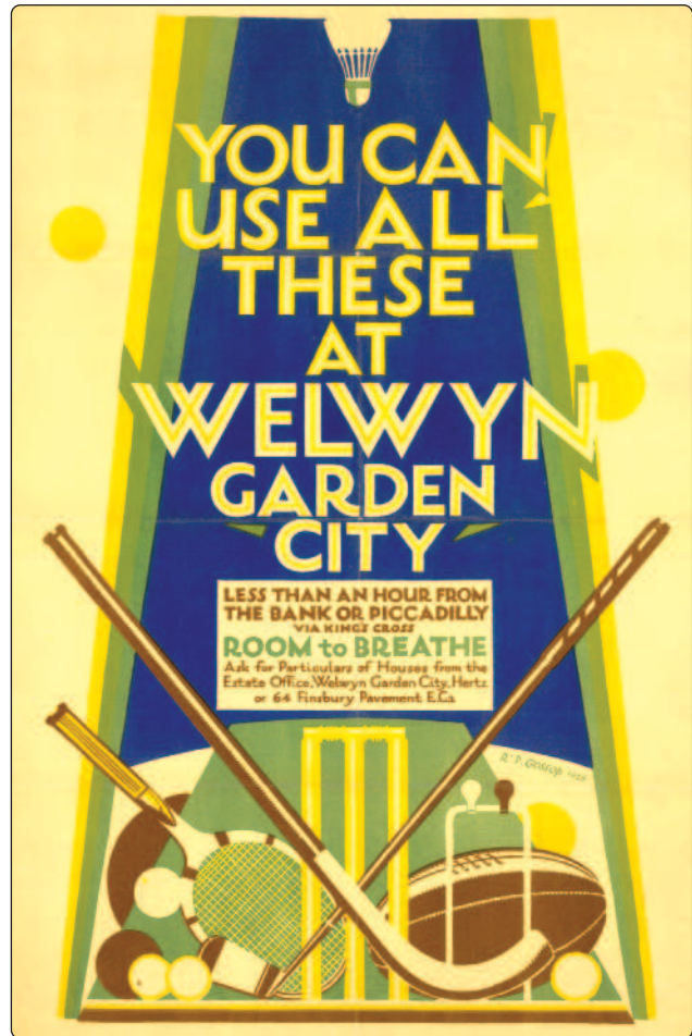
Poster advertising opportunities at the then newly developing Welwyn Garden City – communication is key, and a long-term commitment must reinforce the image of the development itself

A barrier to the long-term commitment of local leaders can be that national and local politicians sometimes work to political cycles rather than beyond them. Without strong local leadership it will not be possible