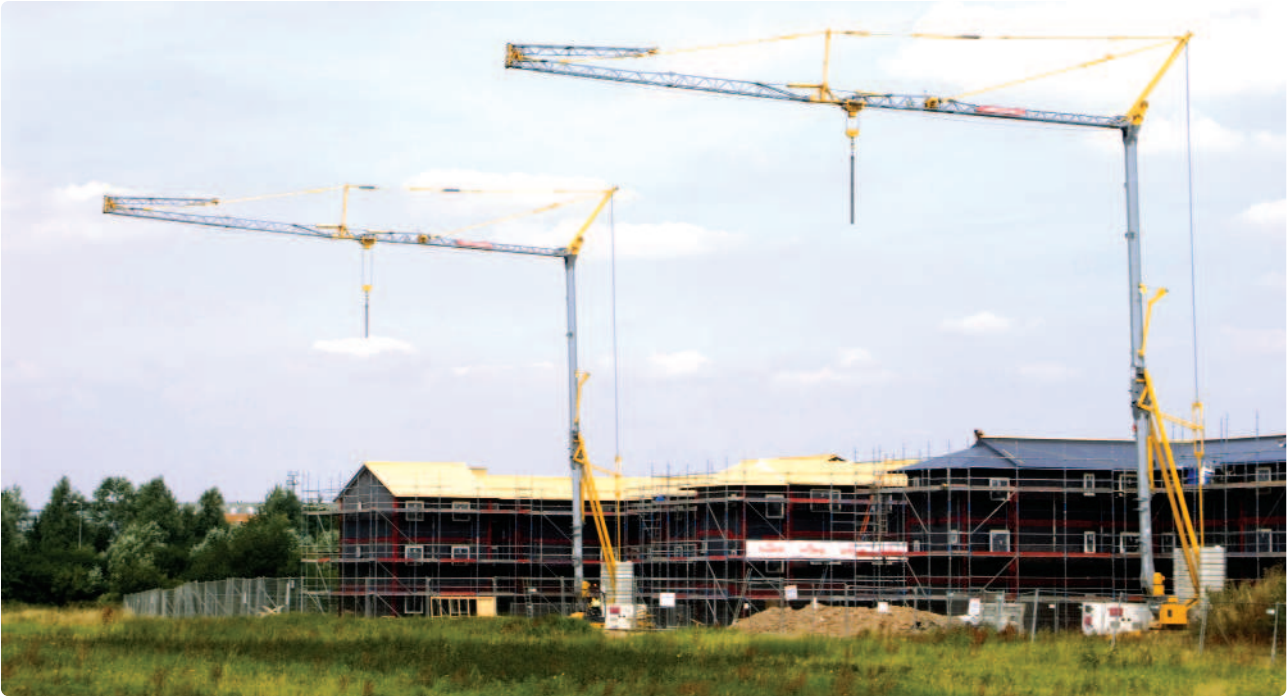
Long-term, patient development finance is crucial

opportunities, so as to recognise the longer-term delivery nature of large-scale projects. This in turn could give greater certainty and confidence that public sector support would be in place to help overcome key infrastructure and cash flow challenges.