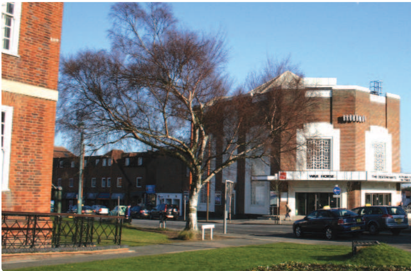
The Broadway cinema at Letchworth – one of the benefits of the operation of Letchworth Garden City Heritage Foundation