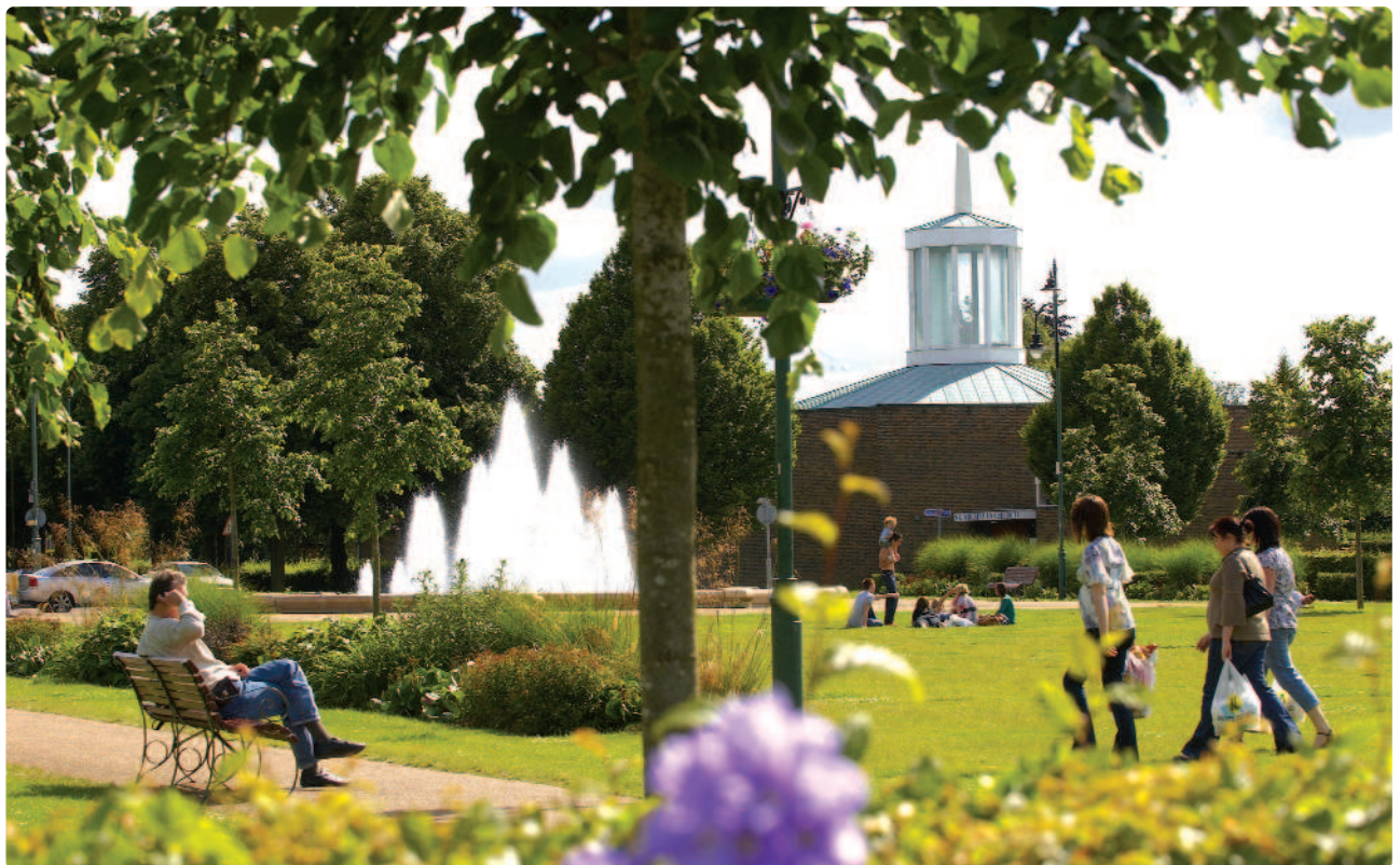
Letchworth Garden City – the potential to create new Garden Cities and Suburbs as modern, healthy and desirable new living and working communities is immense