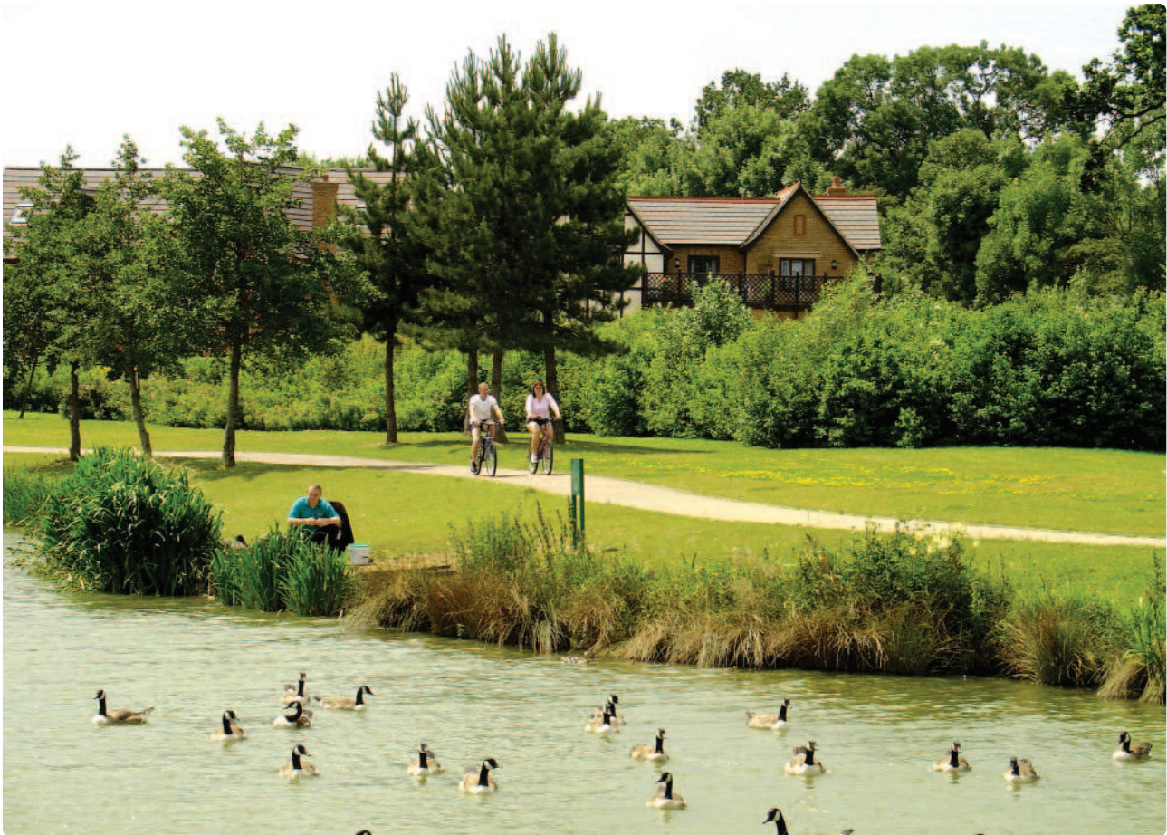
Planning applications for a new Garden City or Suburb should demonstrate a range of types of green space

group self-build or self-commissioned sites. Homes on these sites could comprise a mixture of market and more affordable models of custom build homes which meet a local need. The serviced plots model could also be explored.