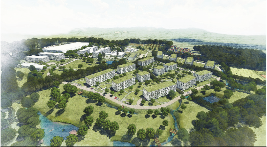
The Temple Farm development in Chelmsford is accredited with BREEAM Communities 'Outstanding' rating

BREEAM/Watch Tower Bible and Tract Society of Great Britain