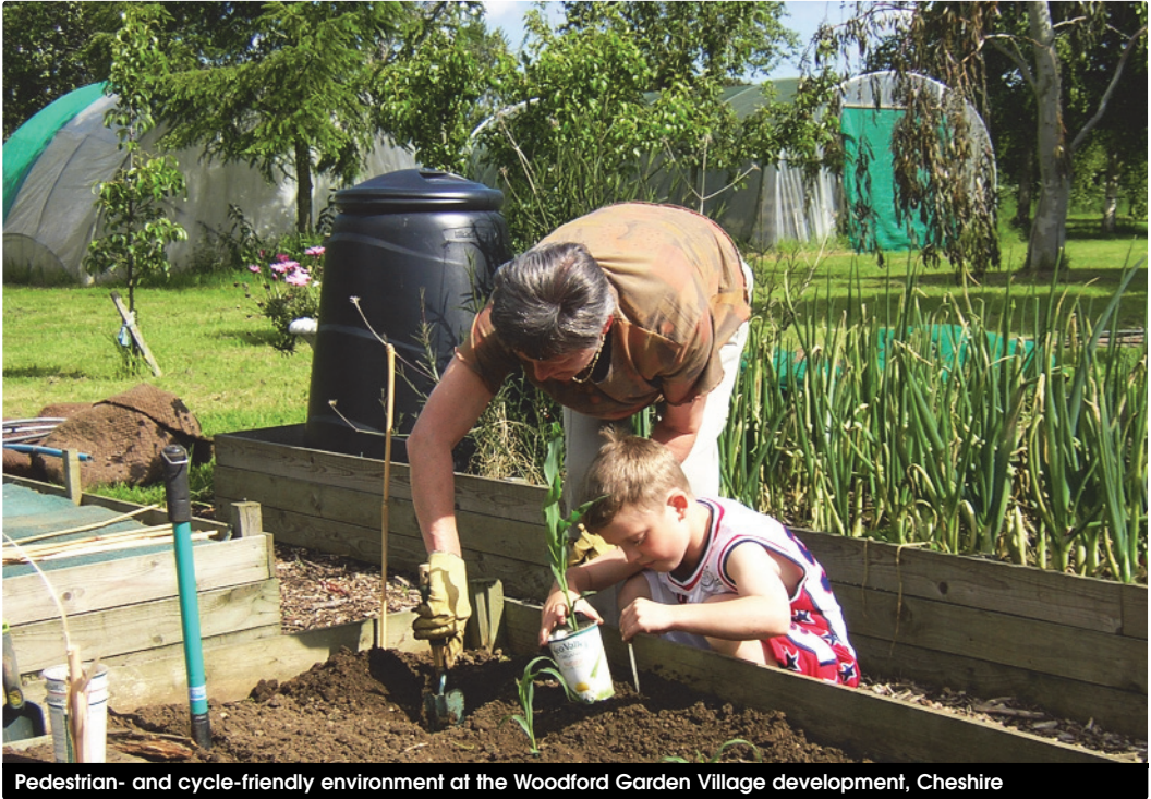
Pedestrian- and cycle-friendly environment at the Woodford Garden Village development, Cheshire

Local authorities should consider the wider food environment within which the development sits. Ensuring proximity and good access to the provision/production of healthy food environments, supported by community activities, is an essential part of the creation of healthy places. Sometimes this may require restricting the proliferation of unhealthy food outlets using planning and wider local authority powers. In keeping with the original Garden City ideals, local authorities and delivery partners of new communities can design-in a healthy food environment by allocating a proportion of open space to food-growing uses in consultation with the local community, and by maintaining awareness of potential health impacts when designating retail uses in planned neighbourhood centres. They should consider the following factors: