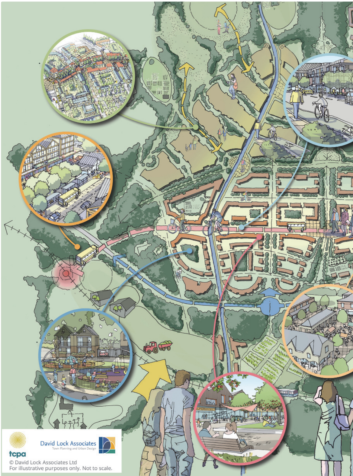
Fig. 2 Healthy development principles and guidelines